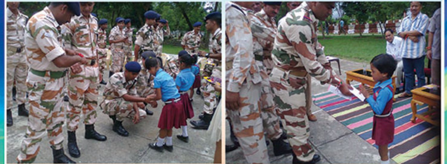
Rskhya Bandhan Programme at Basar, Arunachal Pradesh by Nybom Balwadi (Run by Arunachal Vikas Parishad) on 10.8.2014