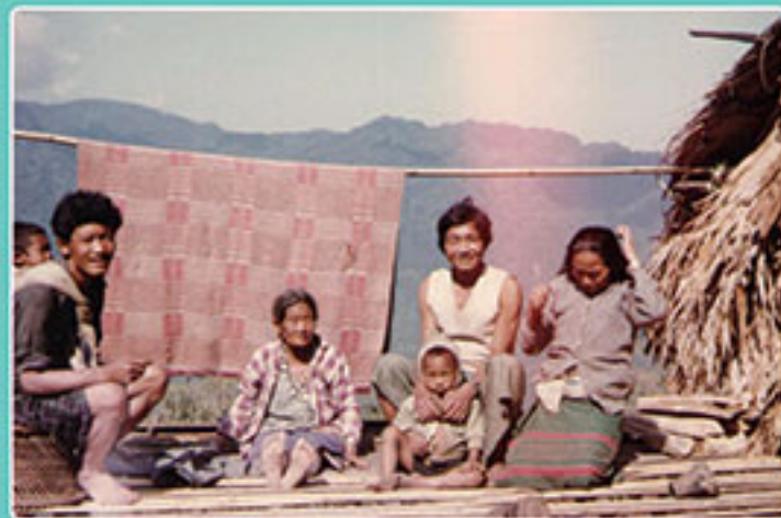
Photos of Tangsa Janajati of Arunachal Pradesh