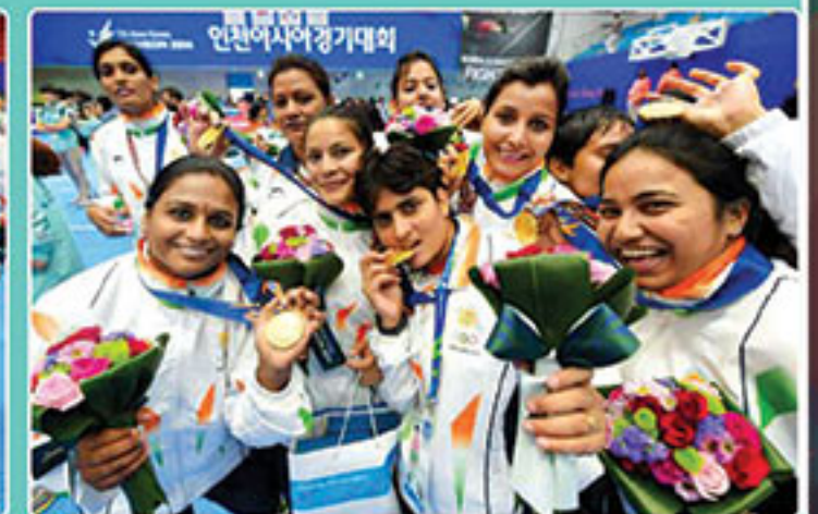
Kabaddi - women Indian women's kabaddi team with their gold medals