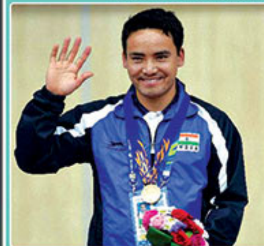
Jitu Rai Jitu Rai brought India's first gold medal in Incheon. In won the men's 50 metres pistol shooting.