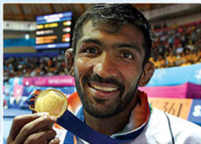
Wrestling gold Yogeshwar Dutt poses with his gold medal after winning the men's freestyle 65kg final