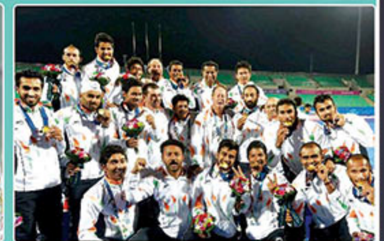
Hockey Indian men celebrate after taking the gold in hockey. They beat Pakistan 4-2 in penalty shootout in the final. It was 1-1 after regulation time. They ended a 16-year wait for gold