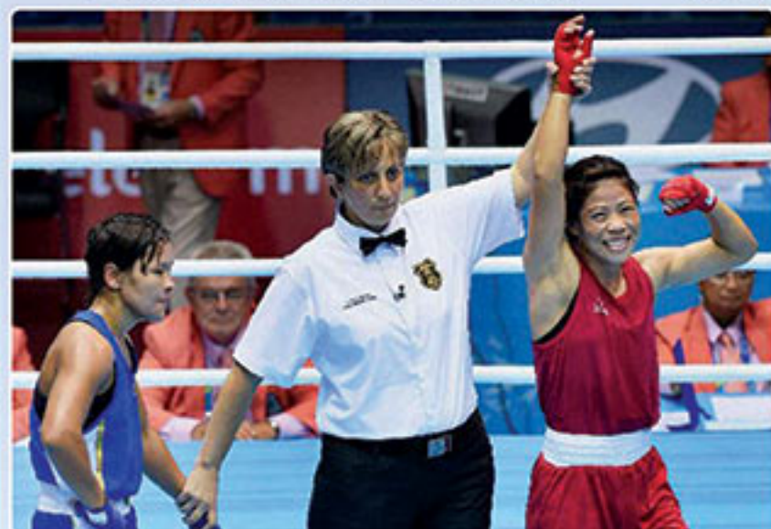
Boxing Mary Kom (right) is declared winner in the final of women's boxing flyweight 48-51 kg category