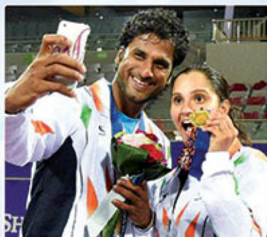
Tennis mixed doubles Saketh Myneni takes a selfie with Sania Mirza as they celebrate after winning gold in mixed doubles