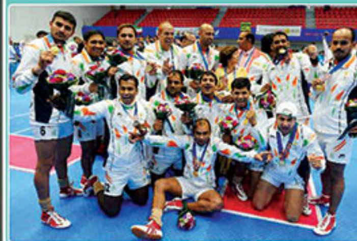
Kabaddi - men Indian men's kabaddi team with their gold medals