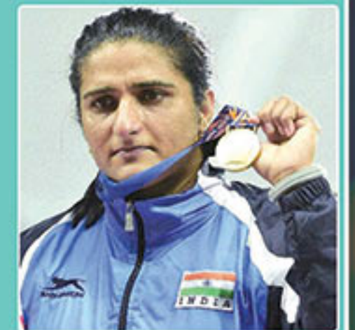
Discus throw Seema Punia with her gold medal after topping in the women's discus throw