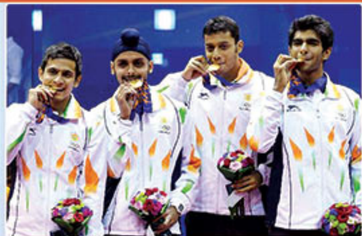
Squash team Gold medal winners Saurav Ghosal, Harinder Pal Singh Sandhu, Kush Kumar and Mahesh Manonkar during the medal ceremony of Men squash team event