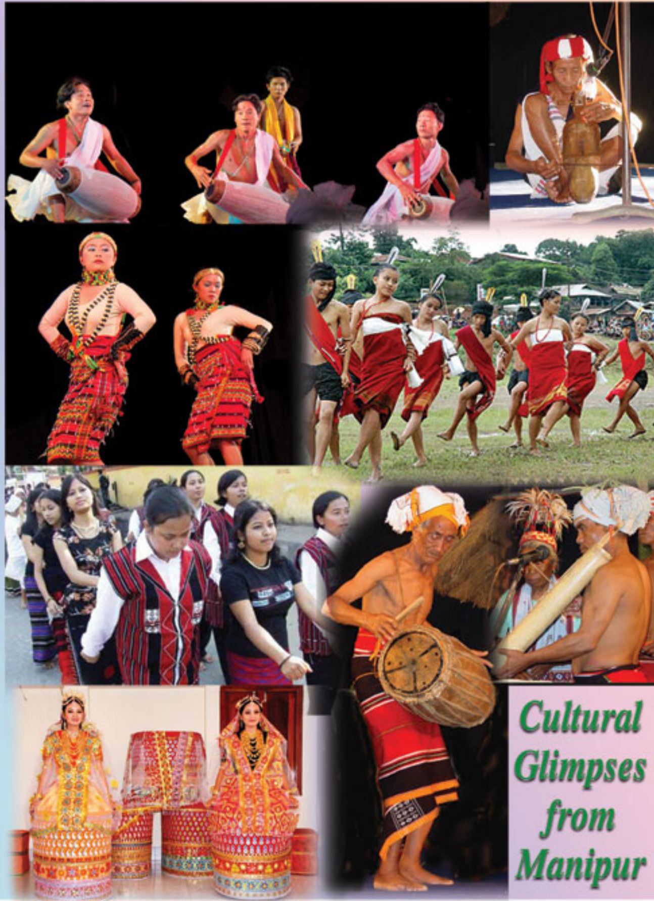
Cultural Glimpses from Manipur